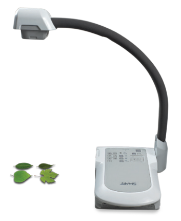
SMART Document Camera uses a high-resolution camera to display clear and detailed objects in real time.

When you can take an object – a leaf, for example – and display it for all to see, it's easier for students to understand higher-level concepts like photosynthesis. You have a visual, kinaesthetic way to teach and learn.